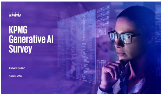
KPMG Generative AI Survey