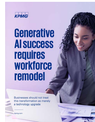
Generative AI success requires workforce remodel

Some or all of the services described herein may not be permissible for KPMG audit clients and their affiliates or related entities.