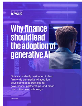
Why finance should lead the adoption of generative AI