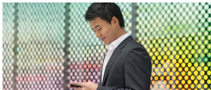
IFRS 15 for sectors