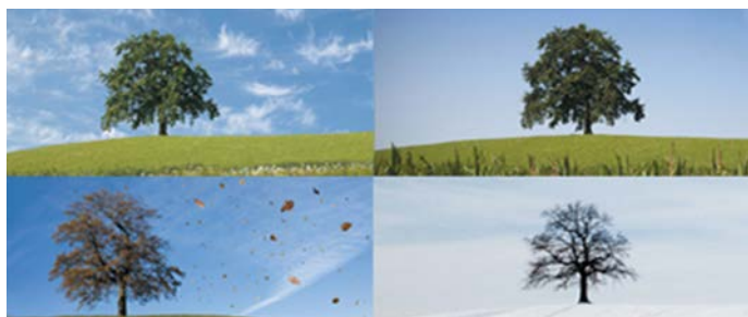
Newly effective standards