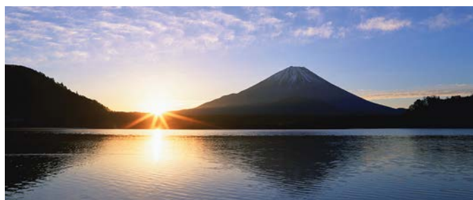
Presentation and disclosures