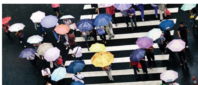
Insurance contracts (under development)